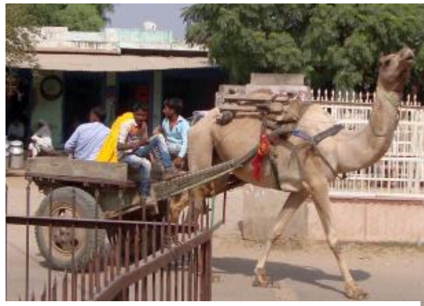
One of many transport options, Rajasthan