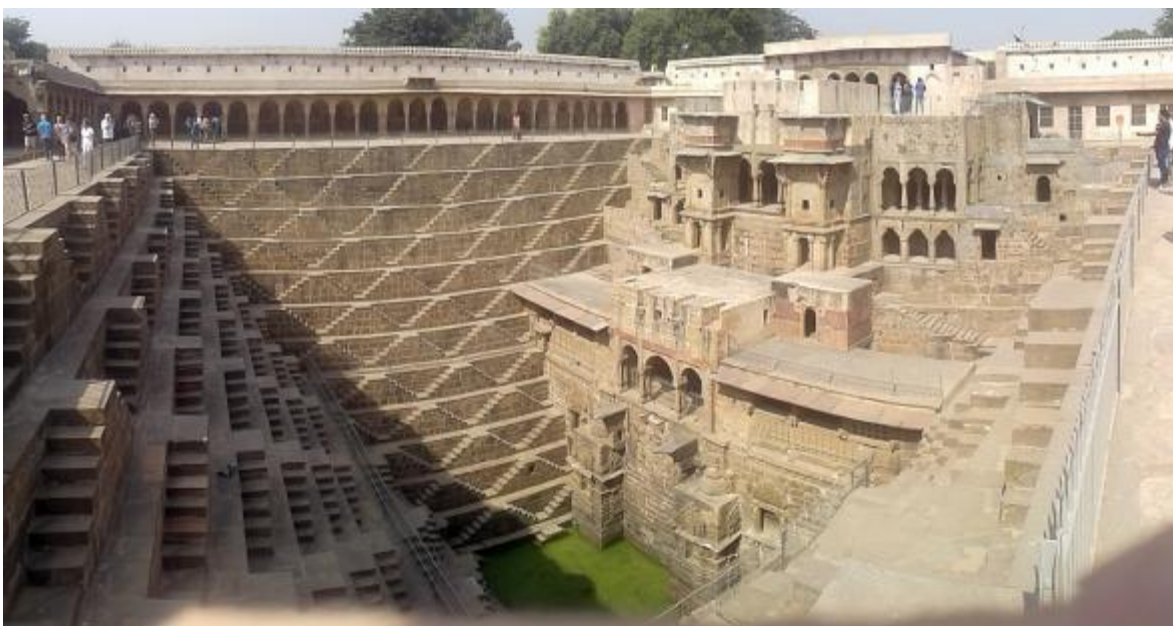
A "Step Well", actually a rainwater cistern, Rajasthan, 9 th century