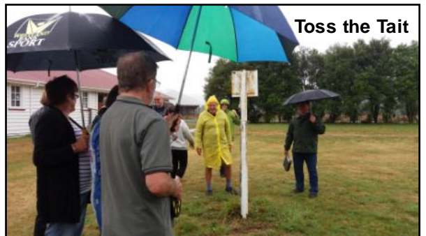
Toss the Tait