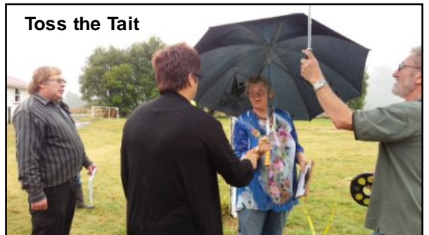
Toss the Tait