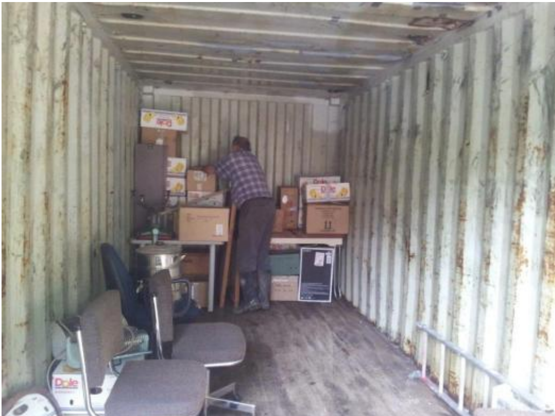
Figure 3 Branch05 junk lovingly stored away

Some pictures of the clearance from 27 Galbraith Avenue clubrooms.