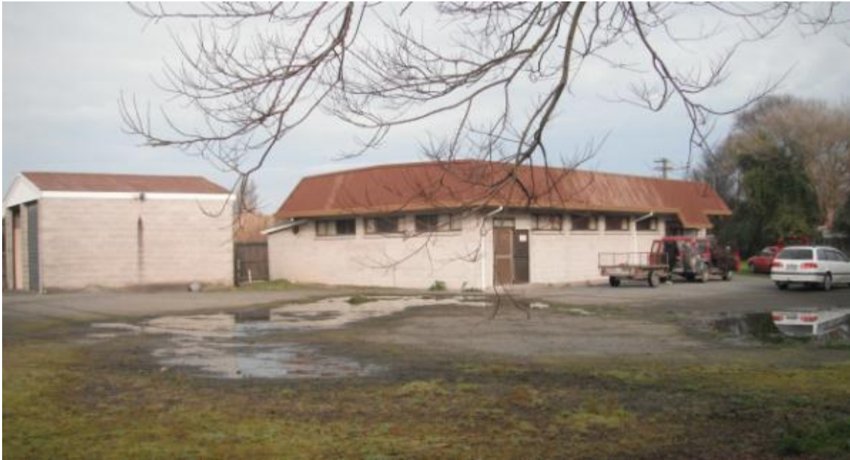
Figure 4 One desirable residence available, quiet location, with garage, overlooking marina.