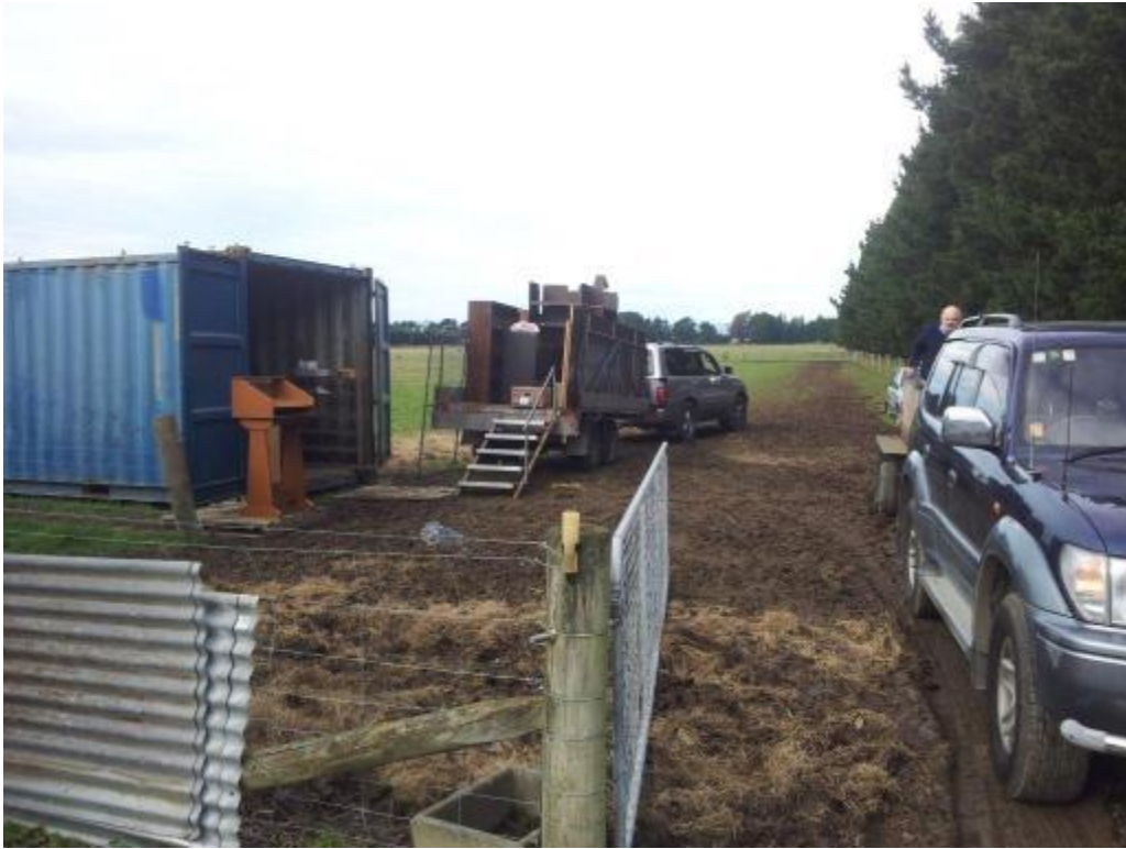
Figure 6 Access to the Branch 05 container