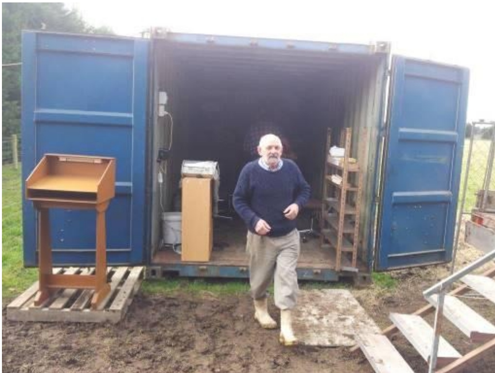
Figure 7 Look at the mud on my carpet!