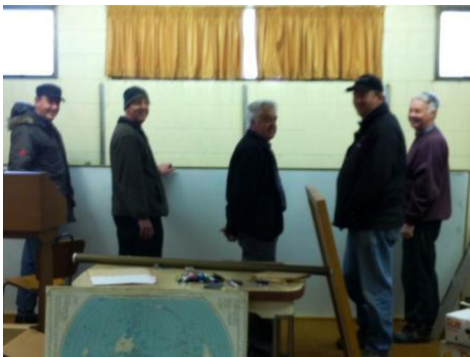
Figure 2 The “How to remove the White Board” Committee.

The RadioTek gear with the brown chairs is stored at my work as it is easier to get to than the container.