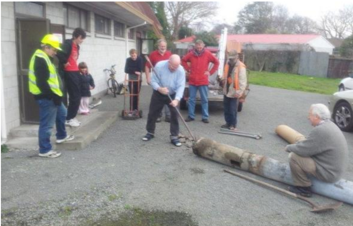
Figure 5 The human guided torpedo gives some trouble