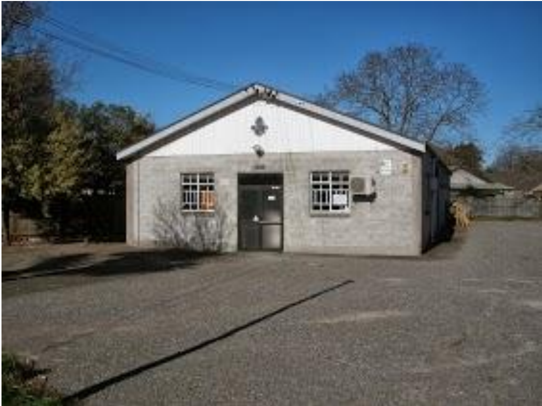
Figure 2 Front view of scout hall, 5 Idris road