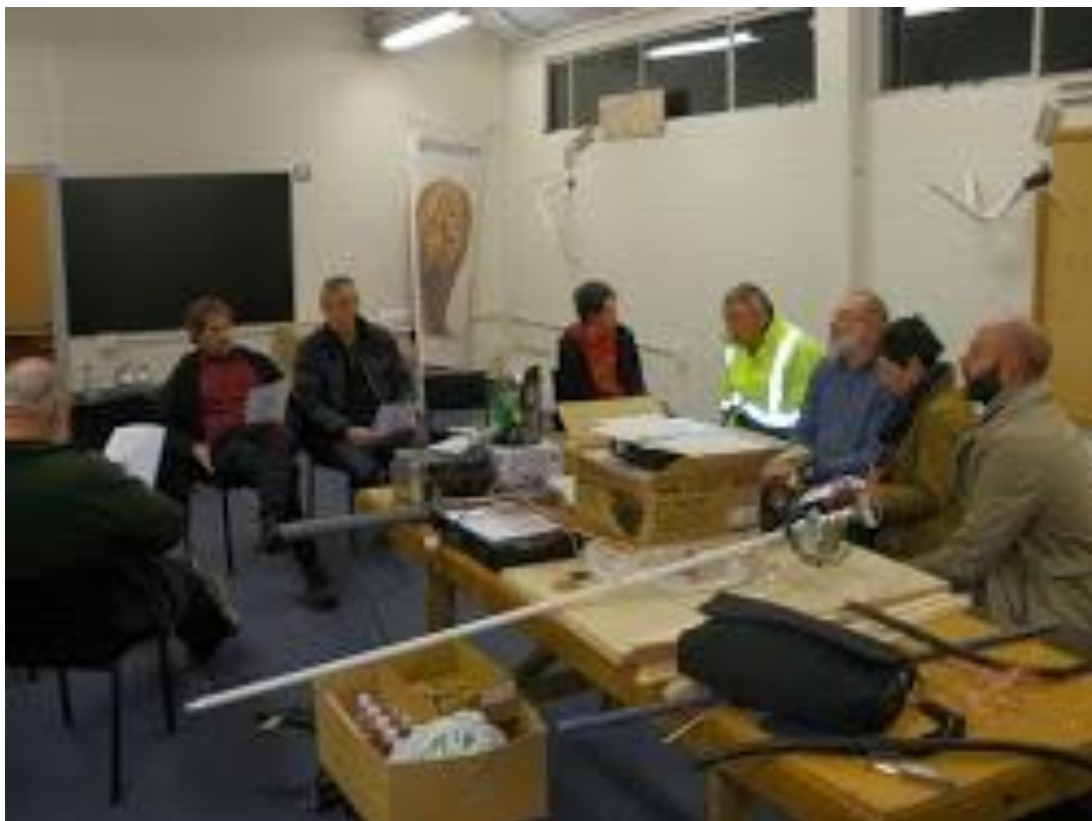
Figure 1 A planning session for SCAPE in progress