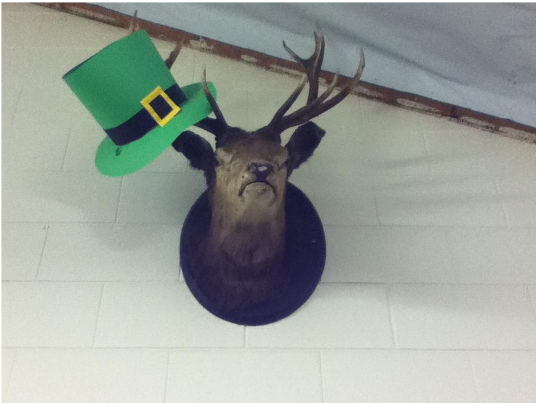
Figure 3 Top loaded, 6 element Yagi