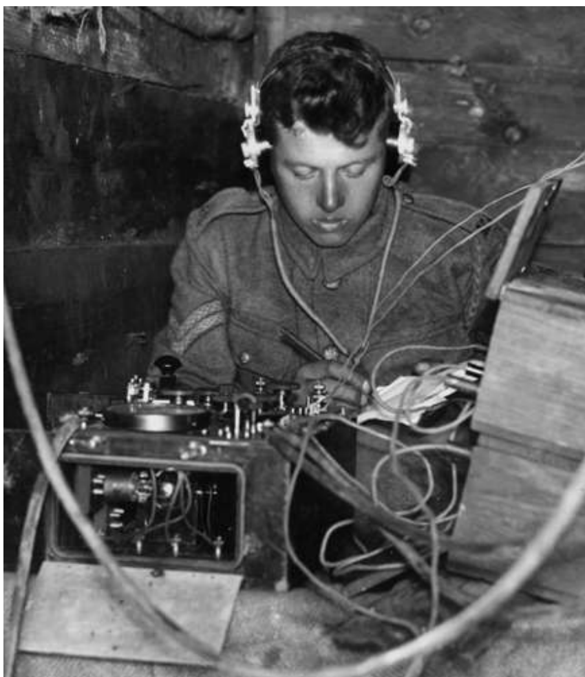
Marconi trench set WW1

WIA also propose to operate similar stations with call-signs VK100ANZAC, VK1ANZAC etc. The period of operation proposed by WIA is greater but NZART feel that most operators would prefer a shorter period of operation as this makes it easier to focus the effort required. In association with the use of these call-signs NZART proposes to sponsor a special 'ANZAC' award.