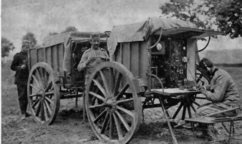
Marconi portable wireless WW1

enable an amateur to book a 2 hour slot on a band using either CW, Phone or Data. Given the number of bands and modes available it is not envisaged that there would be a problem booking suitable slots throughout the activity period. The ZL100ANZAC call will be most sought after and will be available to branches to book for a short time before the booking system goes live to all. However it is envisaged that other operators will also get a fair chance to use this call-sign if they wish.