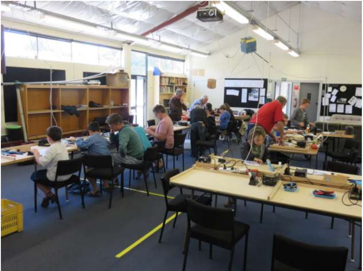
Radiotek November 2014

See http://www.chchhamradio.org.nz/radiotek/index.html