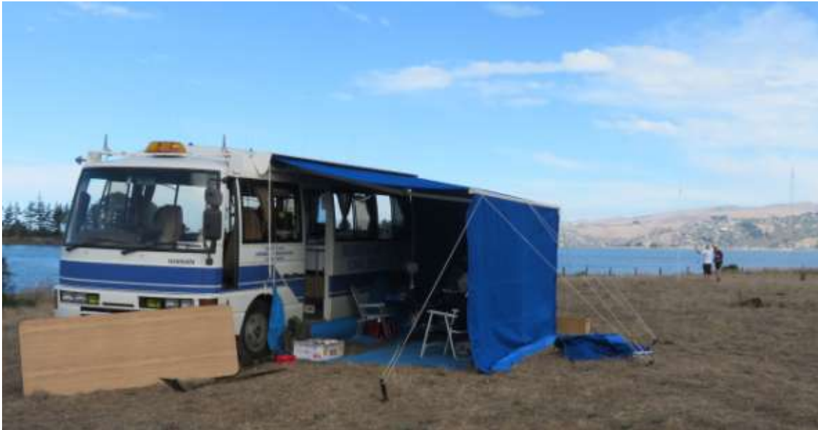
Figure 3 Operating "tent" for 80m station