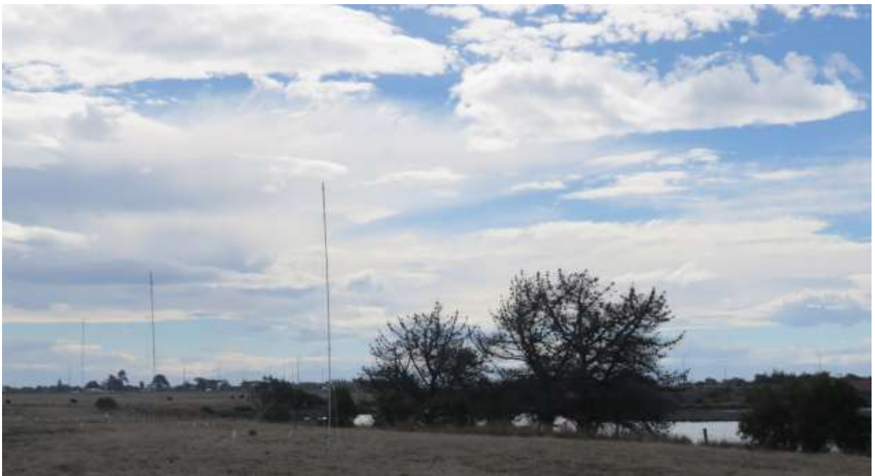
Figure 5 The problem site for 40m antenna