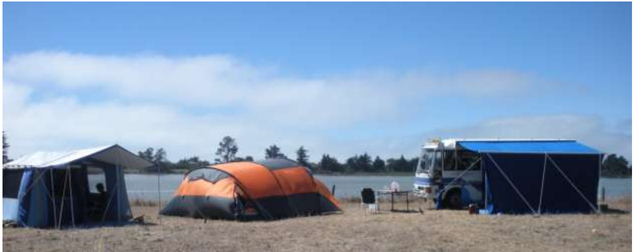
Figure 6 40m on left, Logging tent centre, 80m on right