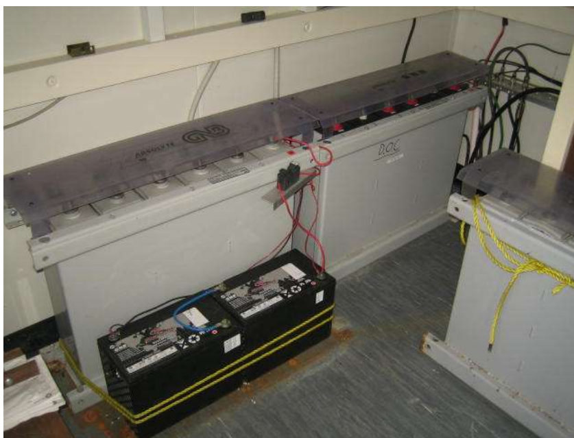
Figure 3 DOC63 batteries