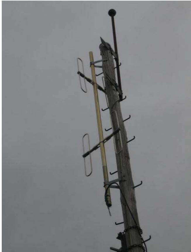
Figure 2 725 aerials

So we achieved info for panels but no 725 resolution!