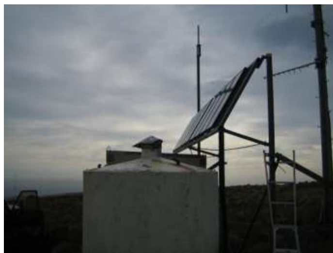
Figure 1 Tank shade panels

Repeater all tested OK. 110db Rx & 25 watts out so no idea what the problem is. Except we found water in the white trunking around the coaxes so if one has nick or is slightly porous could be the issue. SWR