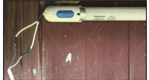
3 pics above: Power feed to lighting along pathways between accommodation and restaurant, Phonsavan, Laos