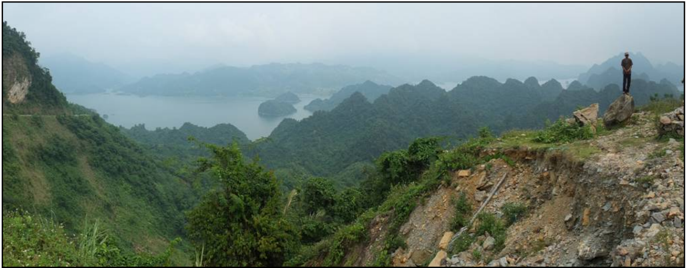
Overlooking the Da River, Vietnam

VHF - USB Net Wednesdays 1930 144.150MHz