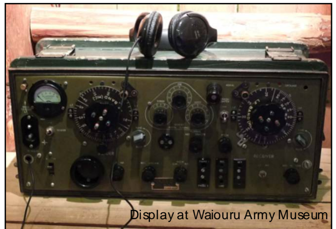
Display at Waiouru Army Museum