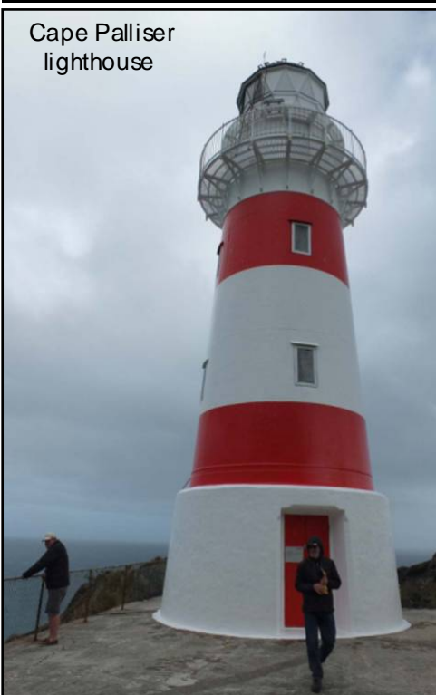
Cape Palliser lighthouse

Lat. 41° 36.8' S, Long. 175° 17.4' E. Light first shone 27.10.1897. There are 253 up to the lighthouse. Cast iron tower 18m high, 78m above sea level. Light flashes 2x every 20 secs & can be seen for 48kms. 1,000W lamp operates on mains electricity with diesel generator on standby. Originally burnt oil, converted to diesel-generated electricity 1954 then mains electricity 1967. Fully automated 1988.