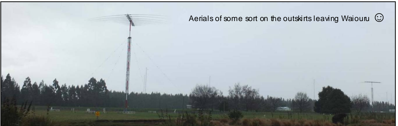
Aerials of some sort on the outskirts leaving Waiouru ☺