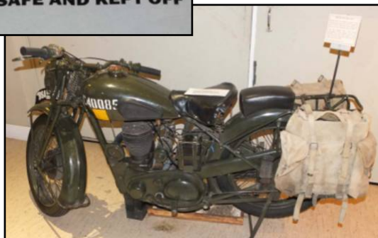
Sign on the seat of this BSA motorbike in the Waiouru Army Museum.

WE HAVE TRAINED OUR MOTORBIKES NOT TO CLIMB ON TO CHILDREN.....PLEASE MAKE SURE YOUR KIDS ARE SAFE AND KEPT OFF THEM.